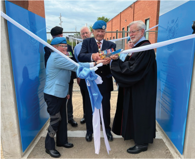
Ribbon-cutting by MGen (Ret'd) Lew Mackenzie of the new Peacekeeping Monument in Peterborough on July 1, 2022