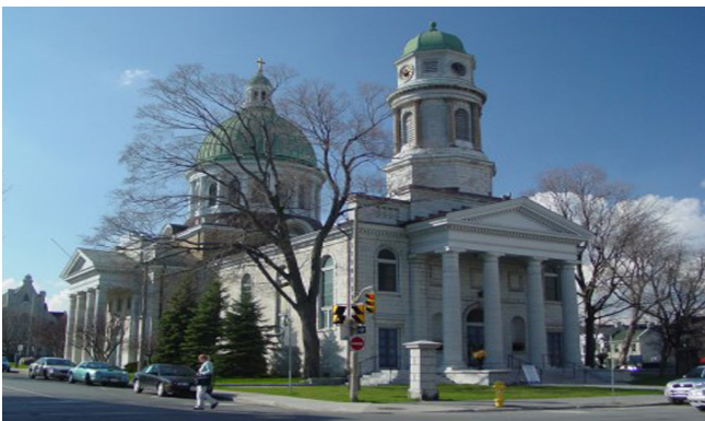
The St. George's Cathedral - Kingston Ontario

https://orderstgeorge.ca/kingston-investiture-2022/